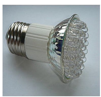
Figure: LED Lamp For Li-Fi

Thanks to the LiFi technology, the 14 billion lamps in the world will become gradually green mobile internet masts that will permit to respond to the impressive increasing demand of mobile connectivity. Also, this will allow reducing the electromagnetic pollution generated by the numerous radio wave solutions developed until now.